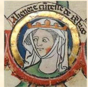
Eleanor de Montfort – long criticised for being her own person